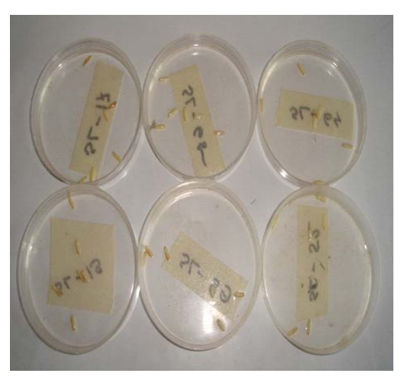
Fig. 2. Alkali digestion of rice grains

Different grain quality traits of the 43 rice genotypes: From the result (Table 1), revealed that there is variation among all the genotypes studied for different quality traits. It ranged from 1 to 4 for aroma score, 1 to 7 for alkali score, 5.9 to 8.0 mm for grain length, 1.6 to 2.5 mm for grain width and 2.3 to 4.7 for grain length-width ratio.